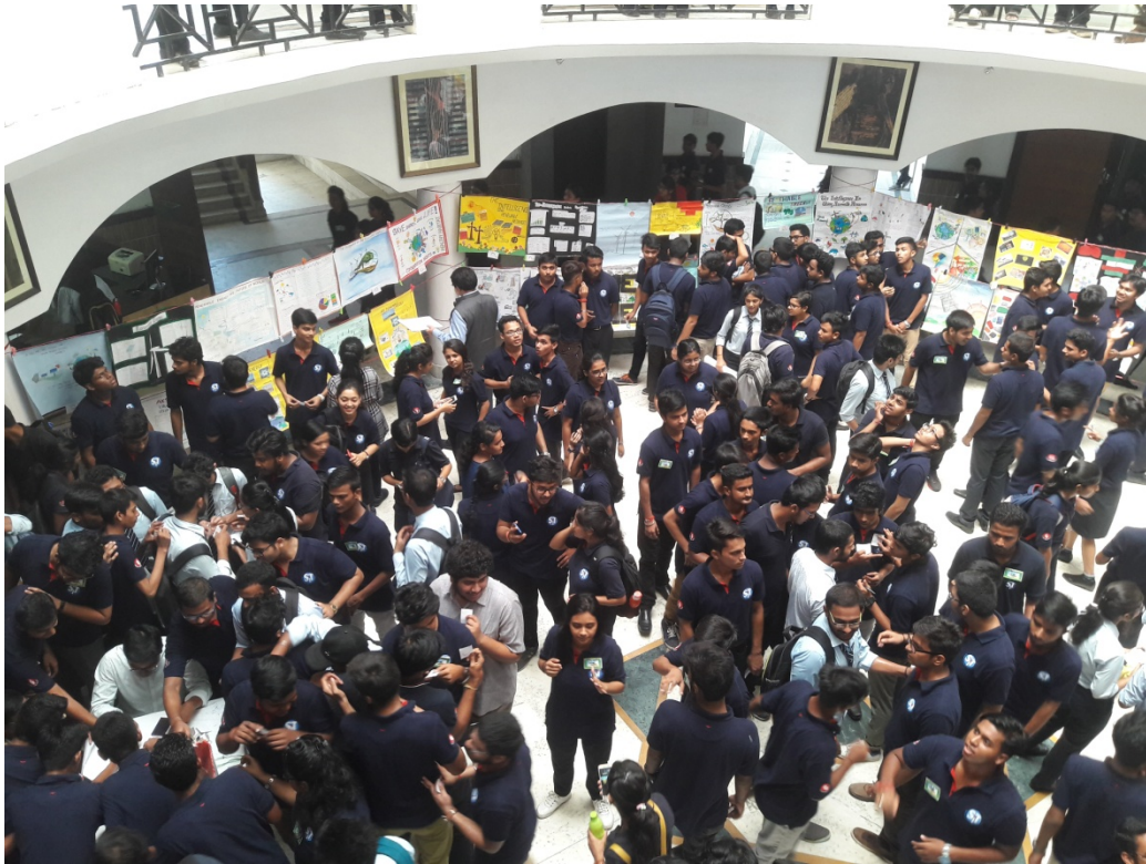
Akshay Urja Diwas Celebration