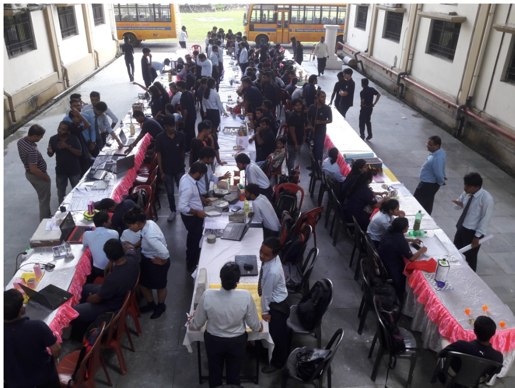
Engineers' Day Celebration